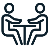
Table Top Exercises

Ensure that your security response plan is going to be effective when an incident occurs. Our team creates scenarios likely to affect your organization, built to test and assess your readiness, training your team to become faster and more efficient in responding to looming threats. These multi-scenario engagements are designed to imitate real world incidents and are complimented with meeting books and a thorough post analysis.