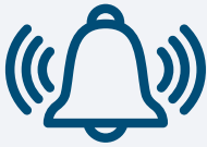
24/7 Tailored Monitoring & Alerting

Take a proactive approach in securing your valuable data with GRA Quantum's Managed Security Services (MSS). We combine the best-in-class technology with unmatched human expertise in order to provide advanced 24/7 threat detection and incident response services. Our technology-agnostic approach gives us the flexibility to incorporate into your existing security infrastructure or begin from the ground-up with the technology that is right for your needs.